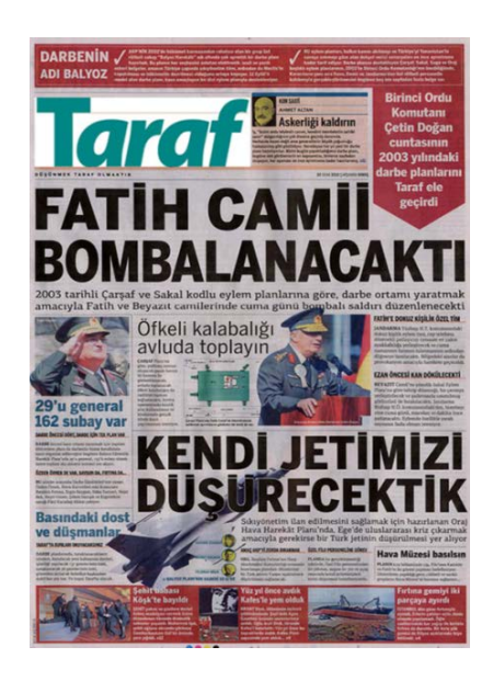
Cover of Taraf on the alleged coup attempt

Today it is widely recognized that the coup plans were in fact forgeries. Forensic experts have <u>determined</u> that the plans published by Taraf and forming the backbone of the prosecution were produced on backdated computers and made to look as if they were prepared in 2003. A quasi-judicial