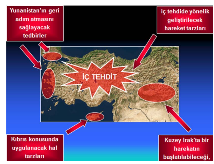
Slide from scenario used in March 2003 seminar

to be formed in Northern Iraq; Kurdish terrorist groups had intensified their attacks around Turkey; relations with the European Union had come to a breaking point; military tensions with Greece, which had downed a Turkish jet, had increased to a boiling point; meanwhile an opportunist Islamist uprising had begun, resulting in widespread killings and looting; the unrest had forced the civilian population to seek refuge in military installments; the government had